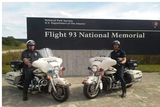
University of Pittsburgh Police Department wins this year's Police Bike 2023 FLHTP!