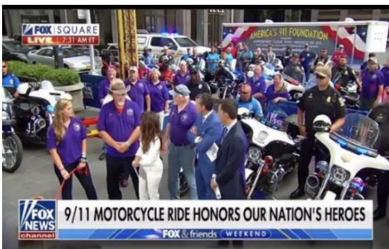
The Foundation at Fox News Sunday August 21, 2022