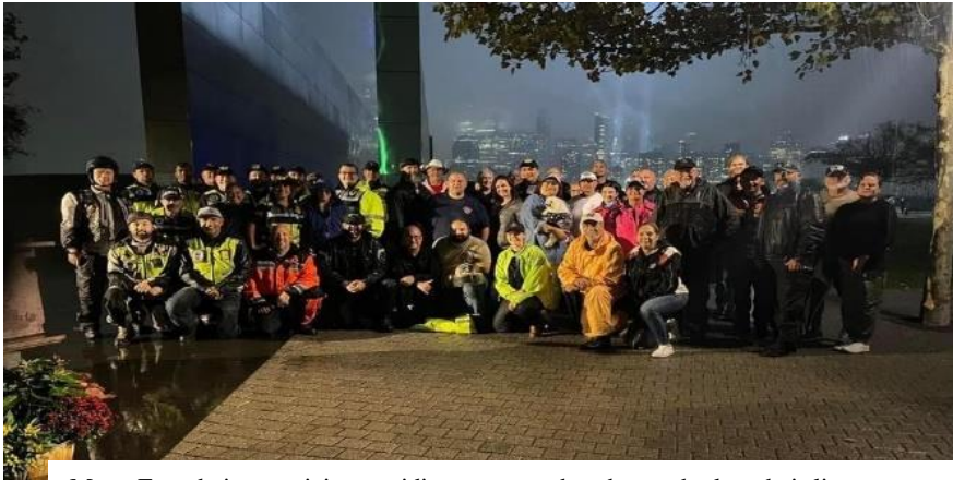
Many Foundation participants riding to remember those who lost their lives on September 11 on 9/11/22 at the Open Skies Memorial.